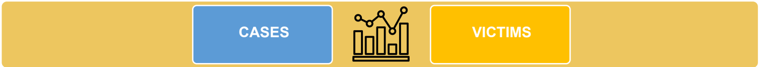
CASES AND VICTIMS ASSOCIATED WITH MARCHES/PAROS/MANIFESTATIONS PERIOD FROM APRIL 28 TO MAY 15, 2021 – Source: Criminal Investigation Directorate and Interpol Crime Information Group