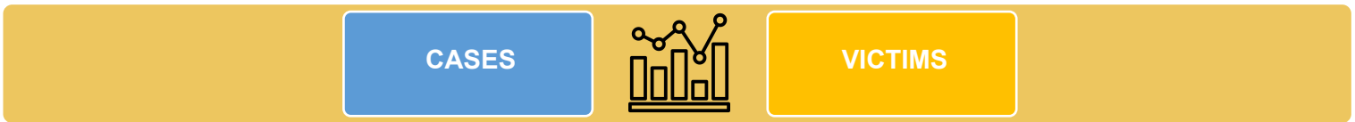
CASES AND VICTIMS ASSOCIATED WITH MARCHES/PAROS/MANIFESTATIONS PERIOD FROM APRIL 28 TO MAY 15, 2021 – Source: Criminal Investigation Directorate and Interpol Crime Information Group