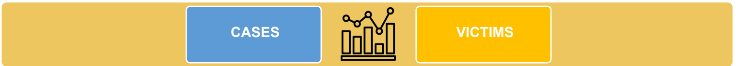
CASES AND VICTIMS ASSOCIATED WITH MARCHES/PAROS/MANIFESTATIONS PERIOD FROM APRIL 28 TO MAY 15, 2021 – Source: Criminal Investigation Directorate and Interpol Crime Information Group