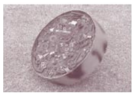
Chinese hat mine

A high-explosive device filled with shrapnel, it is used in ambushes on moving personnel. It is placed in slopes at a height of 80 centimeters.