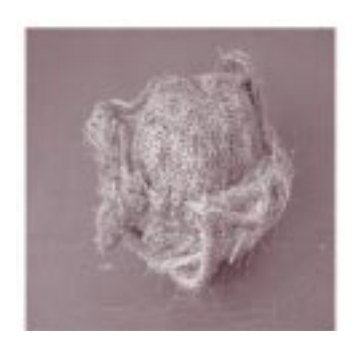
Sisal sack mine

Used in wooded areas, it is hung in tree branches at a height of 50 centimeters. The shrapnel it contains spreads in all directions when the mine explodes.